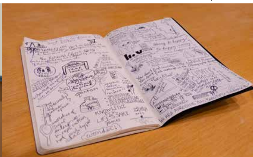
Drawing by Dana Mount.